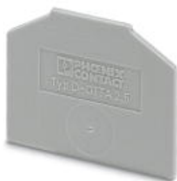
End cover, length: 43.5 mm, width: 1.5 mm, height: 34.3 mm, color: gray

Please be informed that the data shown in this PDF Document is generated from our Online Catalog. Please find the complete data in the user's documentation. Our General Terms of Use for Downloads are valid ( http://phoenixcontact.com/download )